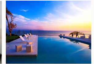
Tranquility surrounds you sun-up to sun-down